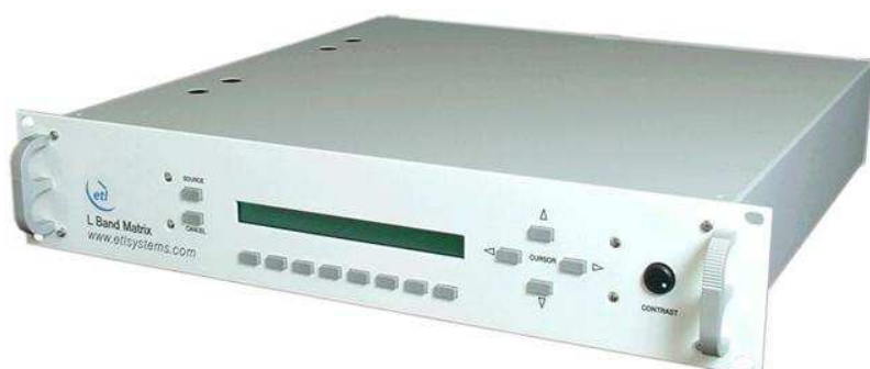
Front view of Model M0808D2UFL-F7F7-A

With Local & Remote Control (via RJ45 Ethernet Port and RS232/422/485 Serial Port)